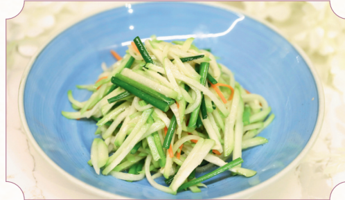
Buddha Hand With Chive Blossoms 韭菜花炆炒佛手瓜 $22