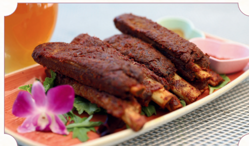
BBQ Ribs Festival 五香孜然烤排骨 $30