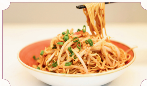
Shao's Cold Noodle 朱司令凉面 $14