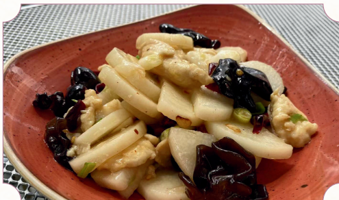
Chicken With Mountain Yam 木耳山药溜鸡片 $24