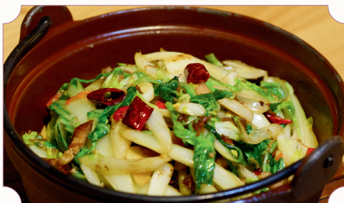
Chinese Cabbage Pot 铁锅娃娃菜 $20