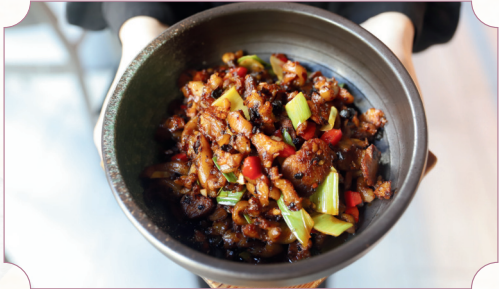
Double Delight Trotter Skin 风味小炒猪蹄皮 $32